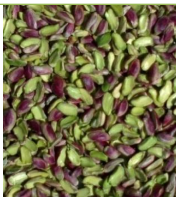
Natural Split / halves

Origin: Mediterranean Sorts: Natural Color: Typical Grade of kernel: Whole / Splits Process: Raw or Roasted Size: - Taste: Sweet Comments: Suitable for raw, roasted consumption or confectionery industry