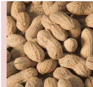
7/9 Extra large